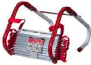
Kidde Fire Escape Ladder, 3-Story, 25... $64.11 Home Depot